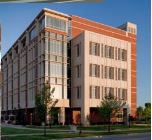
Devon Energy Hall, College of Engineering