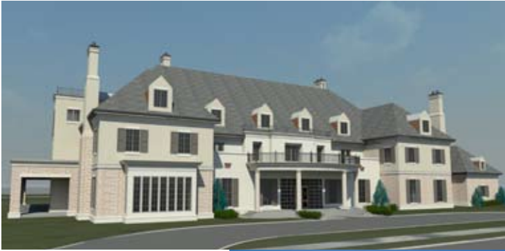
Kappa Sigma Fraternity House